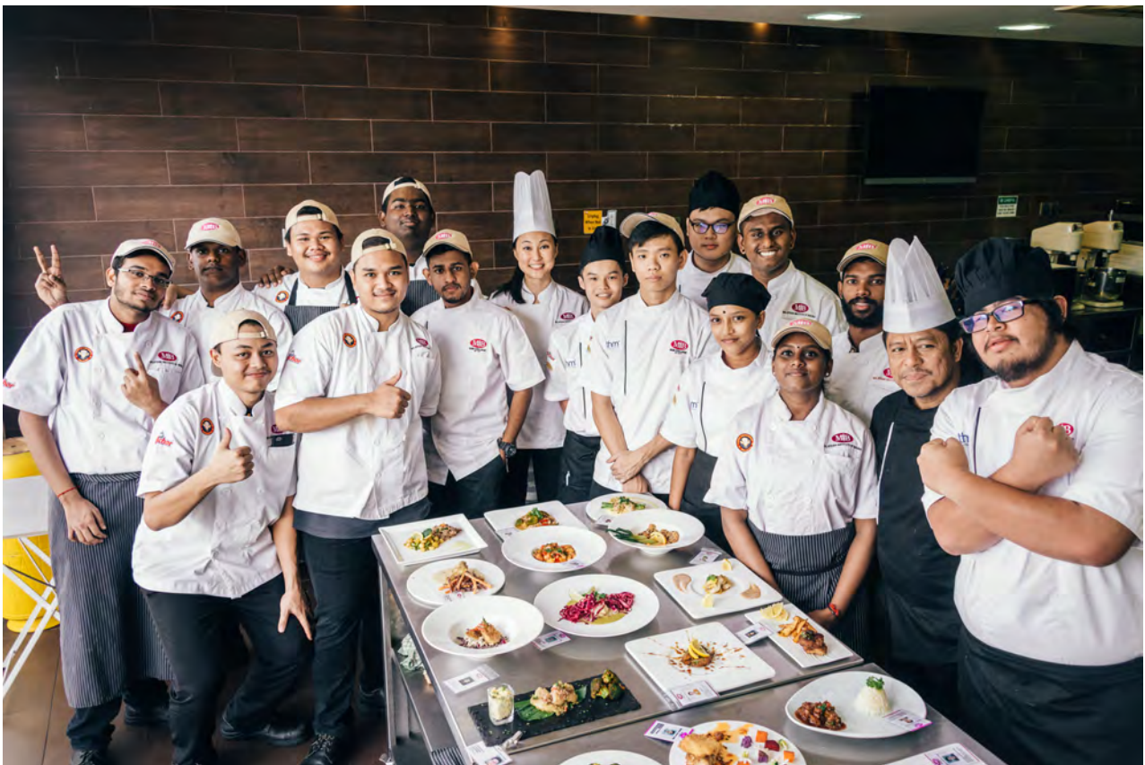
Culinary students posing with their dishes after a Practical Exam.