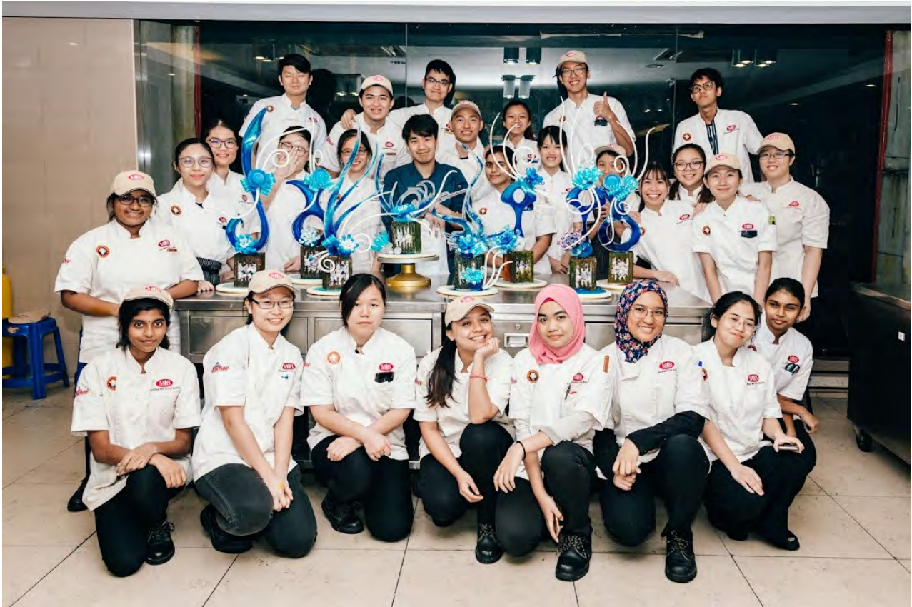
Diploma in Baking Science & Technology students with their sugarcraft showpieces.